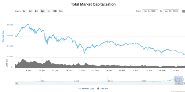
Image 1. Total market capitalization of cryptocurrencies during the entirety of 2018. The decrease in both market capitalization and trading volumes is the defining factor of what we now call the “crypto winter”.

Fast forwarding to 2018, the memory of the dire “crypto winter” should quickly come to mind. Up until late 2017, most tokens were growing steadily, reaching their top values as we entered January 2018. This increase in prices, along with the popularization of the concept all around the world, propelled the release and trading of Bitcoin futures, with which came a time of complete speculation and reduced trading volumes, which caused a constant, steep drop in prices all through the year, reaching falls of around 80%. After this, many people were very pessimistic about the future of cryptocurrency as a whole, with many believing it would not survive 2019.